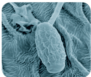
Mildew on Untreated Leaf Surface

It's tough on bacterial and fungal diseases but leaves beneficial insects, including honey bees safe. SERENADE Garden Disease Control Ready-to-Spray is NOP approved, making it an ideal product for safety-minded homeowners.